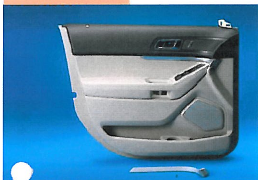
Interior trim with 3-D appearance

A decorative option and an industry first allowed a technical pattern to be injection moulded into an interior trim component, preventing distortion in the pattern in deep-draw areas via graining of the substrate rather than incorporating patterned paint film. This provides greater decorative flexibility for the substrate to be moulded-in-colour, painted, or filmed – all from the same tool. This led to a 10-20% variable cost savings due to use of non-patterned films, and 100% avoidance of multiple substrate tools for different decorative finishes, allowing easy and cost-effective model differentiation.