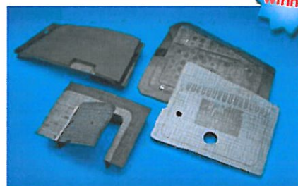
Self-reinforced airbag-door system

This is the auto industry's first airbag door system that integrates an all-PP construction (PP-fibre-reinforced PP). As such, it is fully recyclable and does not require typical post-mould scoring/weakening of the door flap. The injection-moulded door system is a light, less-expensive system solution, since additional components and post-mould operations (to enable the door flap to open/hinge) are eliminated. Multi-zone temperature control of the mould was required, as was use of a vacuum-holding system for the fabric insert.